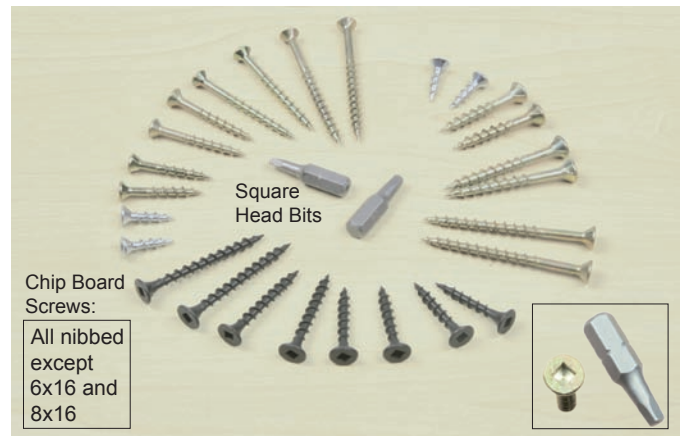
Chip Board Screws: