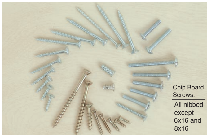
Chip Board Screws: