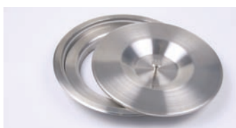
9300000 ECONOMY STAINLESS STEEL WORKTOP BIN WITH PLASTIC INSERT Outside Diameter - 270

WTB PLASTIC WORKTOP INSET BIN LID Diameter - 240mm CHARCOAL - WTBCHL GREY - WTBGRE OAK - WTBOAK WHITE - WTBWH