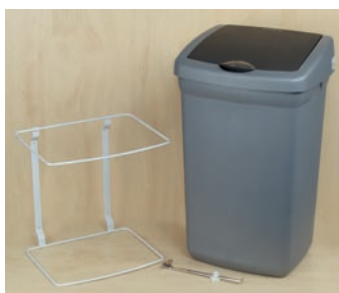
6245 - 45 LITRE TILT BIN 540 x 380 x 315 Including 45L Tilt Bin Lid: H = 615