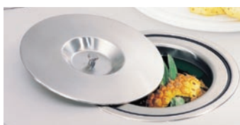
9303204 STAINLESS STEEL WORKTOP BIN Outside Diameter - 306mm Synthetic Bin Bucket Volume - 14 Litre