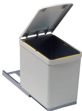
6280 POLYPROPYLENE PULLOUT BIN 15 Litre