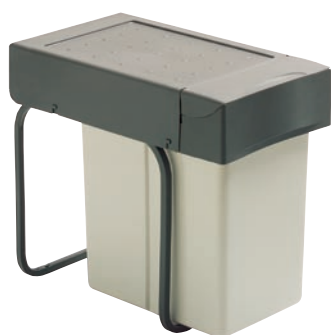
6226 POLYPROPYLENE PULLOUT BIN 20 Litre